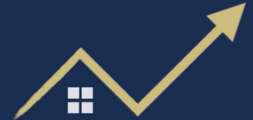
Northants Housing Solutions

Northants Housing Limited offer of a ROI between 10% - 15%